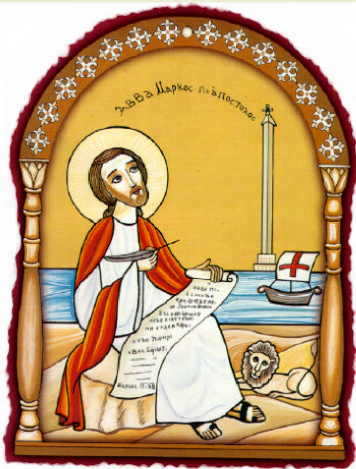
THE BEHOLDER OF GOD MARK THE EVANGELIST SAINT AND MARTYR