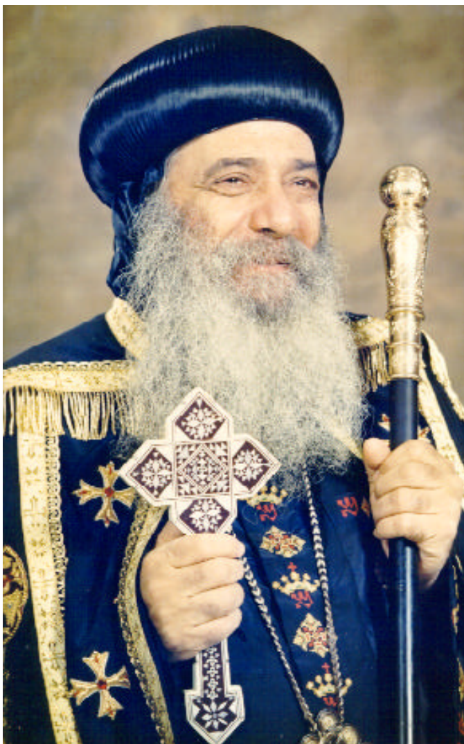
H.H. Pope Shenouda III, 117th Pope of Alexandria and the See of St. Mark