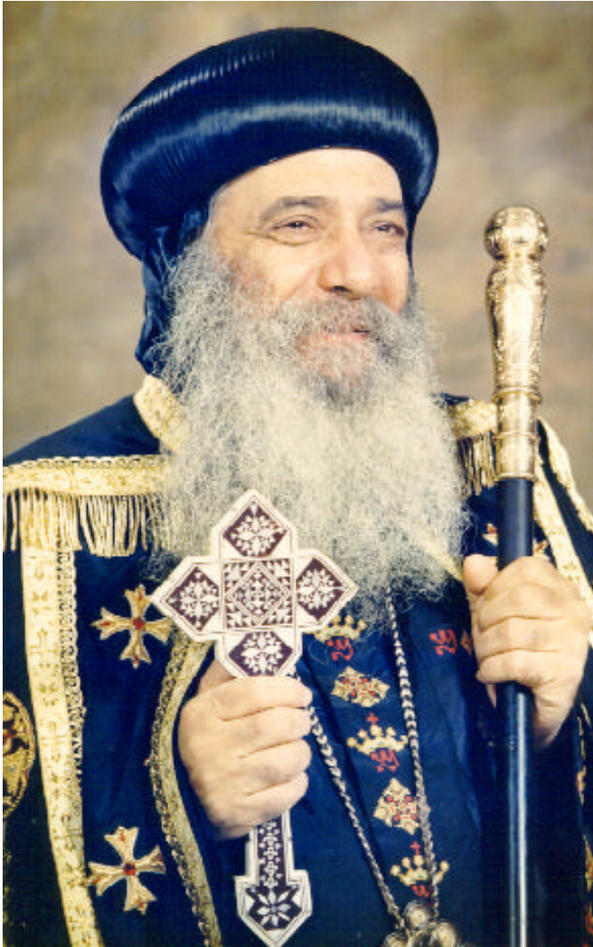
H.H. Pope Shenouda III, 117th Pope of Alexandria and the See of St. Mark